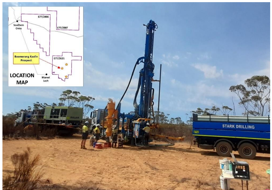
Figure 1. Rig 2 from Stark Drilling collaring 22BMRC001 (the first 2022 RC hole at the Boomerang Prospect) with the Kula on site geologist set up and ready to log. Project and Prospect location shown in inset map.

Kula Gold Limited (KGD) is pleased to announce that reverse circulation (RC) drilling of the Boomerang Prospect at their 100% owned Marvel Loch – Airfield Project has resumed following the festive break.